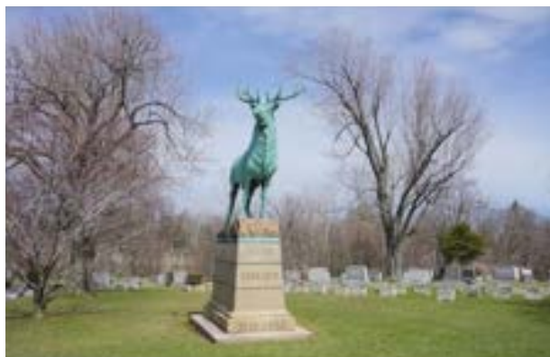
Elks Rests in New Orleans and in Buffalo, New York.

Now , take a short walk around the roundabout to the large Soldiers Memorial. It is the large, triptych-style monument across the road.